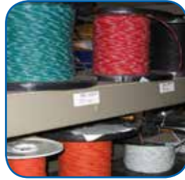
Range of color wire options available