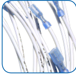
White wire with custom inkjet printing